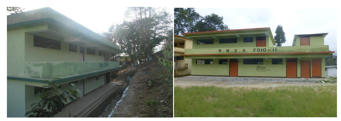
G. Martam SS, East Sikkim and Kabrey SS, South Sikkim (RMSA civil works: 2010-11)