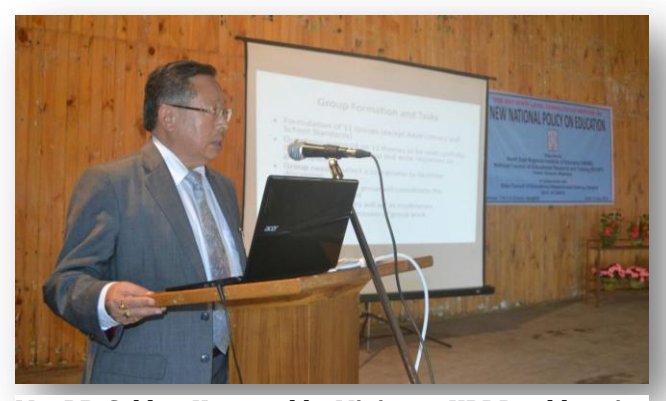
Mr. RB Subba, Honourable Minister- HRDD addressing the participants of "One day state level consultative meeting of educators, civil society members, state level officials" on new national policy on education organized on 6th July, 2015.

SCERT in collaboration with NCERT, Delhi also organized "One Day State Level Consultative Meet on New Education Policy" on 6th July, 2015 inTashiNamgyal Sr. Sec. School, Gangtok. Almost 150 participants comprising of officials from HRDD other Govt Departments, and Teachers from Schools, Colleges & Universities, Civil Society Members, NGO representatives participated in the day long consultative process. The participants were divided into different groups and one theme pertaining to School Education was assigned to them for discussion. Recommendations from each group were presented at the end of the program which was compiled by SCERT officials. Three senior faculty members from NCERT, New Delhi and NERIE, Shillong were present to supervise consultative meeting.