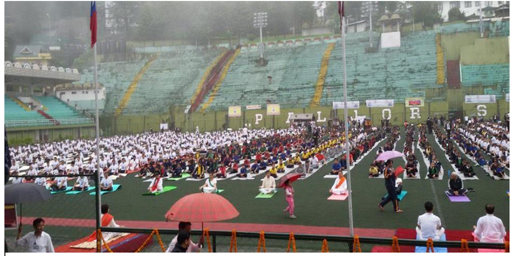
International Yoga Day being observed at Paljor Stadium where 1000 school students participated.