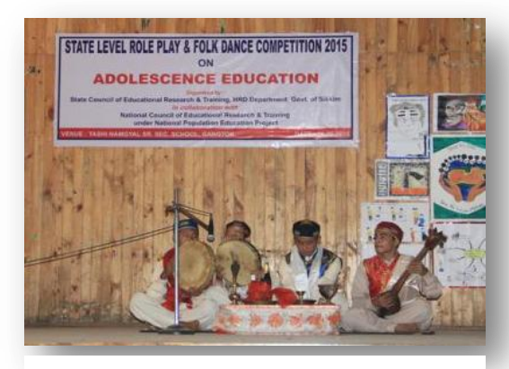
State level Folk Dance and Role Play Competition- 2015

NPEP in Sikkim was initiated in April 1986. Since then a range of activities - Role Play, Folk dance Competition, Painting/Poster making and Slogan writing is organised by Population Education Cell, SCERT. The main objective of these programs is to educate the students and members of community about matters related to Adolescence education. Every year, certain themes are chosen and based on those themes, district-level Role-play Competitionsare held in two districts and the Folkdance Competitions are