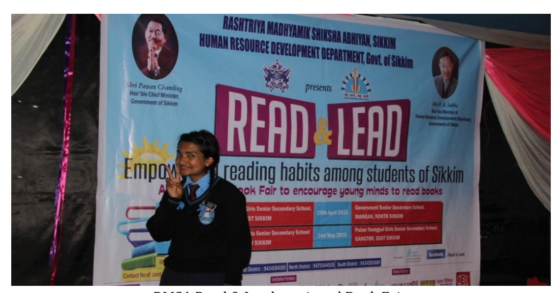
RMSA Read & Lead captioned Book Fair