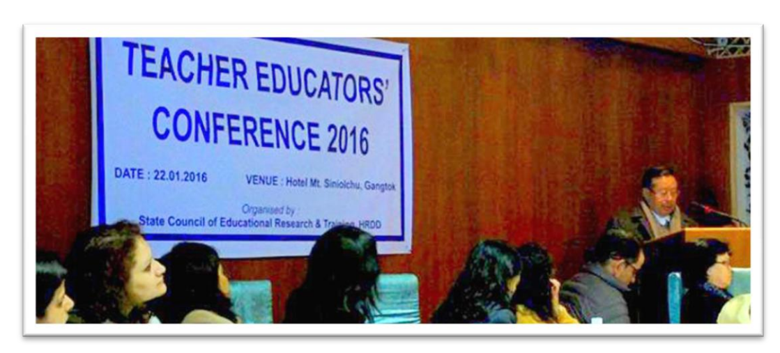
Hon'ble Minister addressing the First Teacher Educators' Conference - 22nd Jan, 2016.

Teacher Educators from SCERT, DIETs and B.Ed. colleges participated in the conference and presented their papers. Also present in the conference were two faculty members from AjimPremji University, Bengaluru.