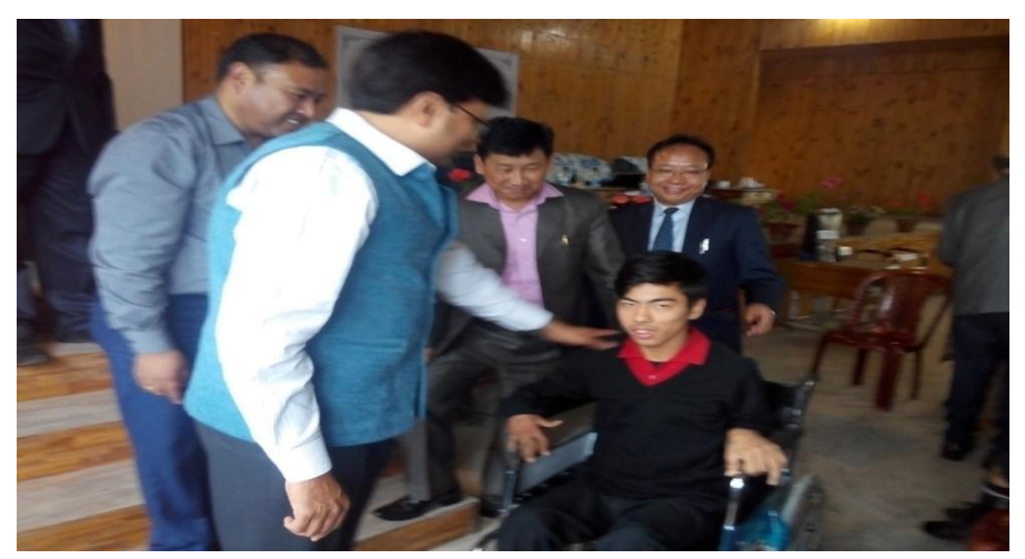
One Day Orientation Programme under IEDSS. Distribution of Assistive devices to CWSNs.

A. The construction work sanctioned during the year 2012-13 i.e construction of Resource Room, Toilets and Ramps has been completed during the year.