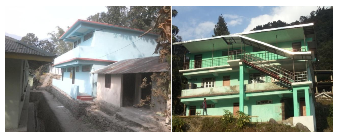
Lower Sumin SS and Rolep SS, East Sikkim (RMSA civil works: 2010-11)

B. The constructed works sanctioned under strengthening and Upgradation of school in the years 2011-12, 2013-14, 2014-15 and 2015-16 have not been started as the funds for the same was received at the fag end of the Financial Year 2015-16.