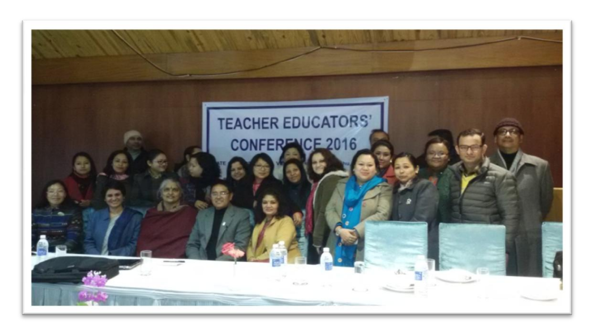
Participants of First Teacher Educators' Conference - 22nd Jan, 2016.