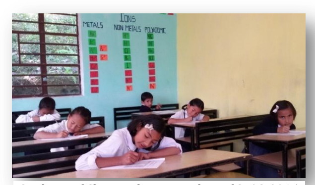
Students of Class III during conduct of SLAS-2015

Conducting Educational Research for helping the state to frame appropriate policies and plan the process of Education in the state is one of the most important work SCERT needs to do. In 2015-16, SCERT conducted several research studies on areas of education and teacher education. The reports of these researches have already been submitted to HRDD and can also be seen in SCERT library and website.