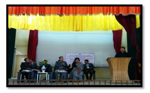
Training of Graduate Teachers Teaching Maths and Science at the Upper Primary Level. 22^{\rm nd} to 28^{\rm th} February 2016,Govt SS School, Soreng, West District