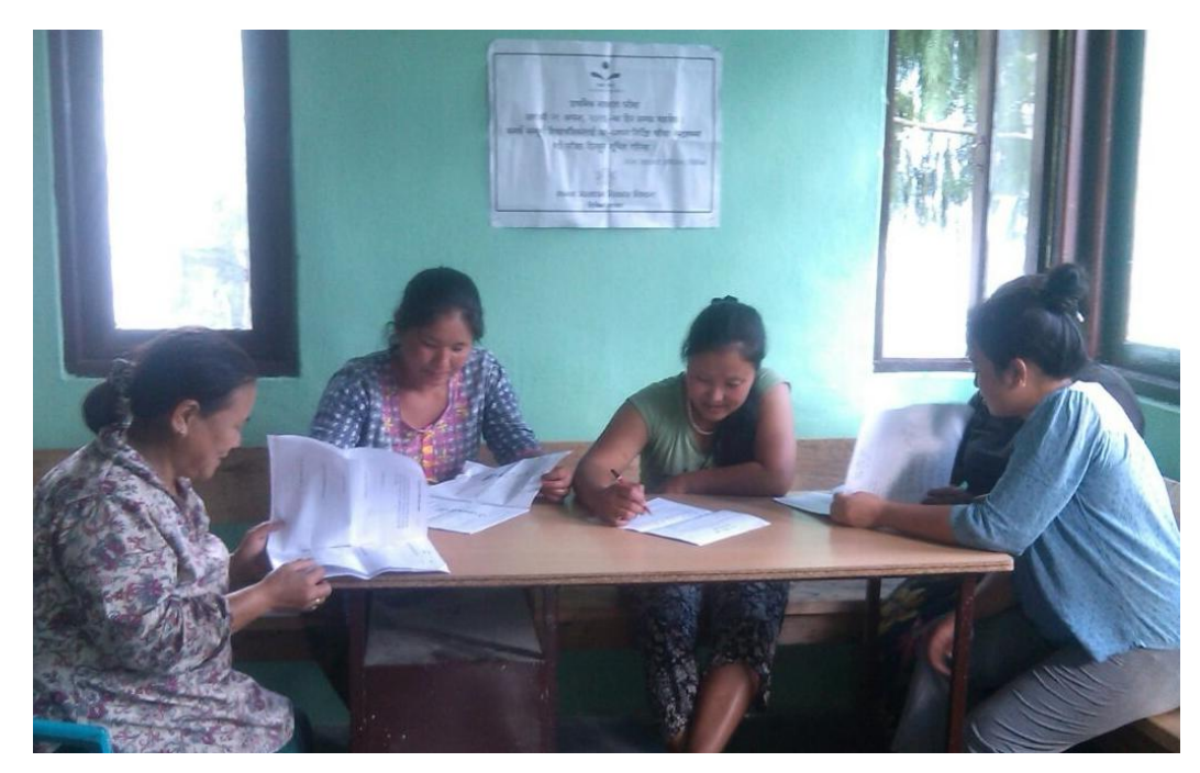
Adult learners attending classes at learning centre

2. Under this approach, voluntary teaching takes place on a mass scale. A literate person within the locality and community voluntarily acts as mobilizer and teacher and is responsible for imparting literacy on an average of 8 to 10 learners.